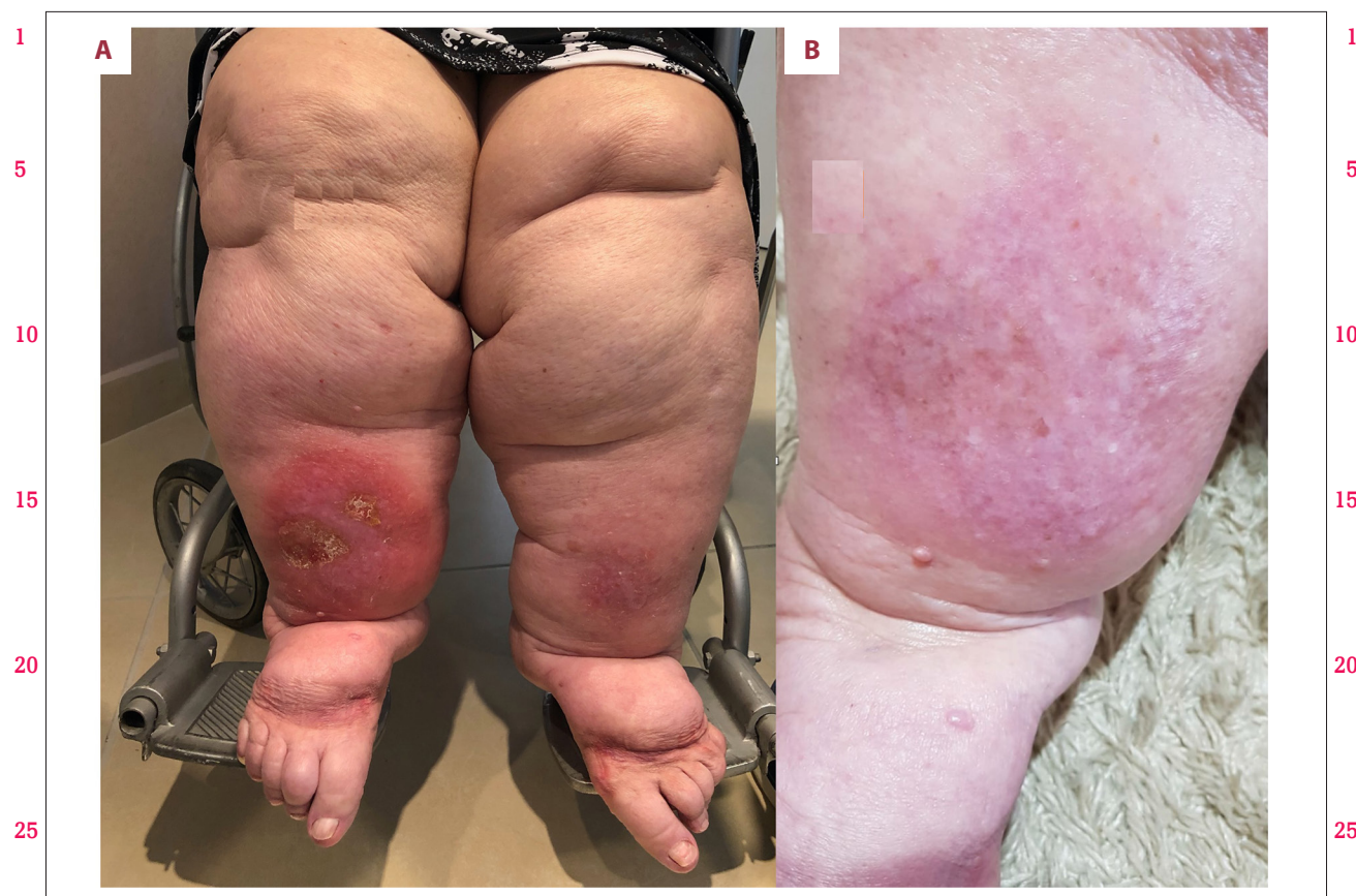
Figure 7. Patient with lipolymphedema, stage 4 lipedema, with erysipelas that was difficult to treat before (A) and after (B) non-surgical treatment for lipedema.

experienced volumetric, symptomatic, and aesthetic improvements. In the second case, symptoms and fat nodules showed significant improvement. In the third case, in addition to the symptomatic improvement, there was significant volume loss. In the fourth patient, who had grade I obesity on the basis of BMI, there was disproportion and substantial fat deposition in the lower limbs. In this case, lipedema mimicked obesity; nevertheless, there was significant volumetric decrease in addition to symptomatic improvement. In the fifth case, the initial objective was the treatment of refractory erysipelas; nevertheless, clinical treatment facilitated the resolution of the persistent infection.