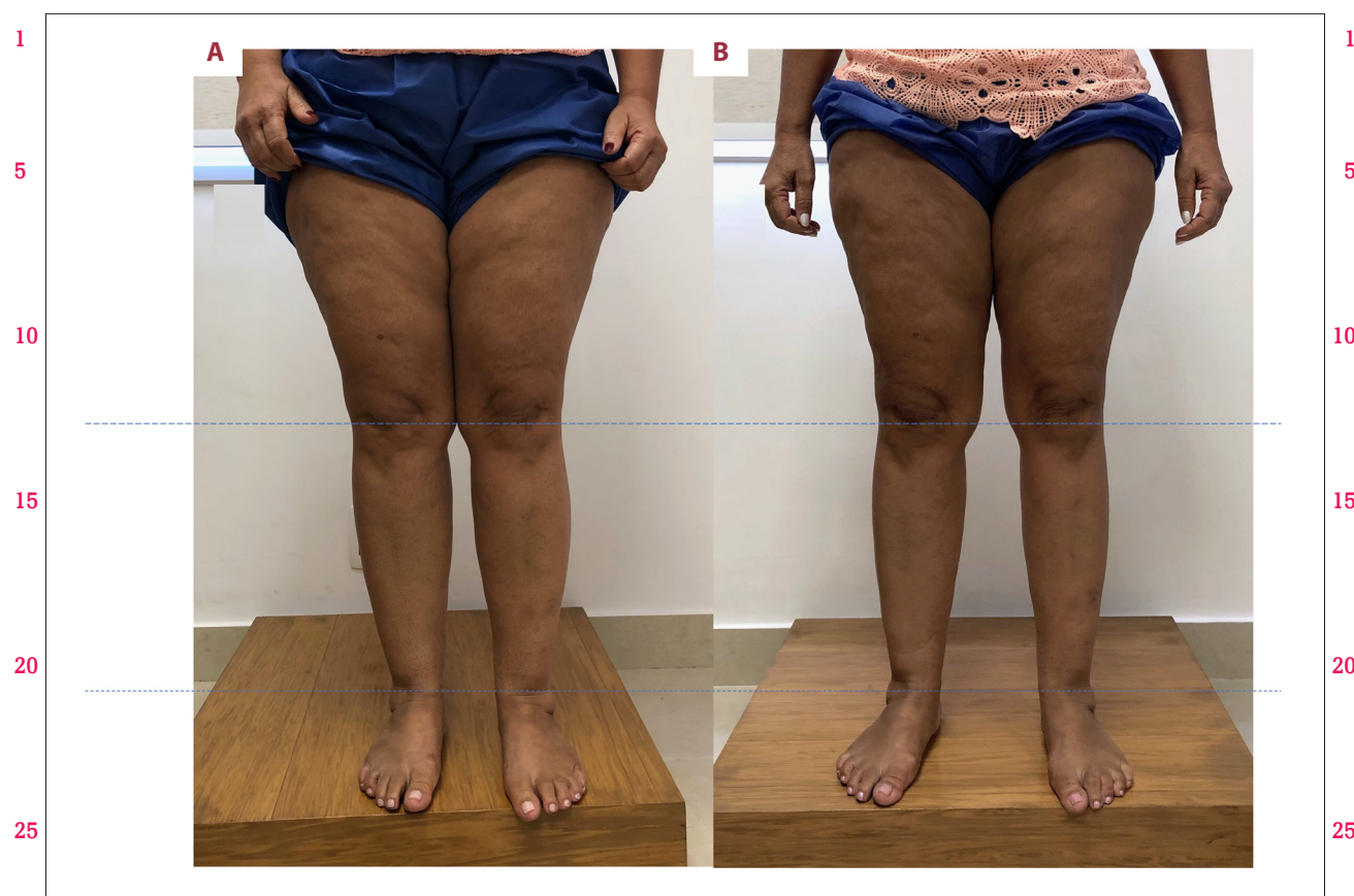
Figure 4. Patient with stage 2 lipedema (A), showing a slight improvement and decrease in fat deposition in the lower limbs (B).

30 Physical examination revealed absence of Godet and Stemmer signs, deposition of fat that was tender to palpation in the lower limbs, and 115 points on the QuASiL. EDCV-MMII revealed small varicosities in the thighs and legs, without significant reflux, with a measured dermal thickness of 22.4 mm and 35 21.2 mm in the right and left pre-tibial regions, respectively.