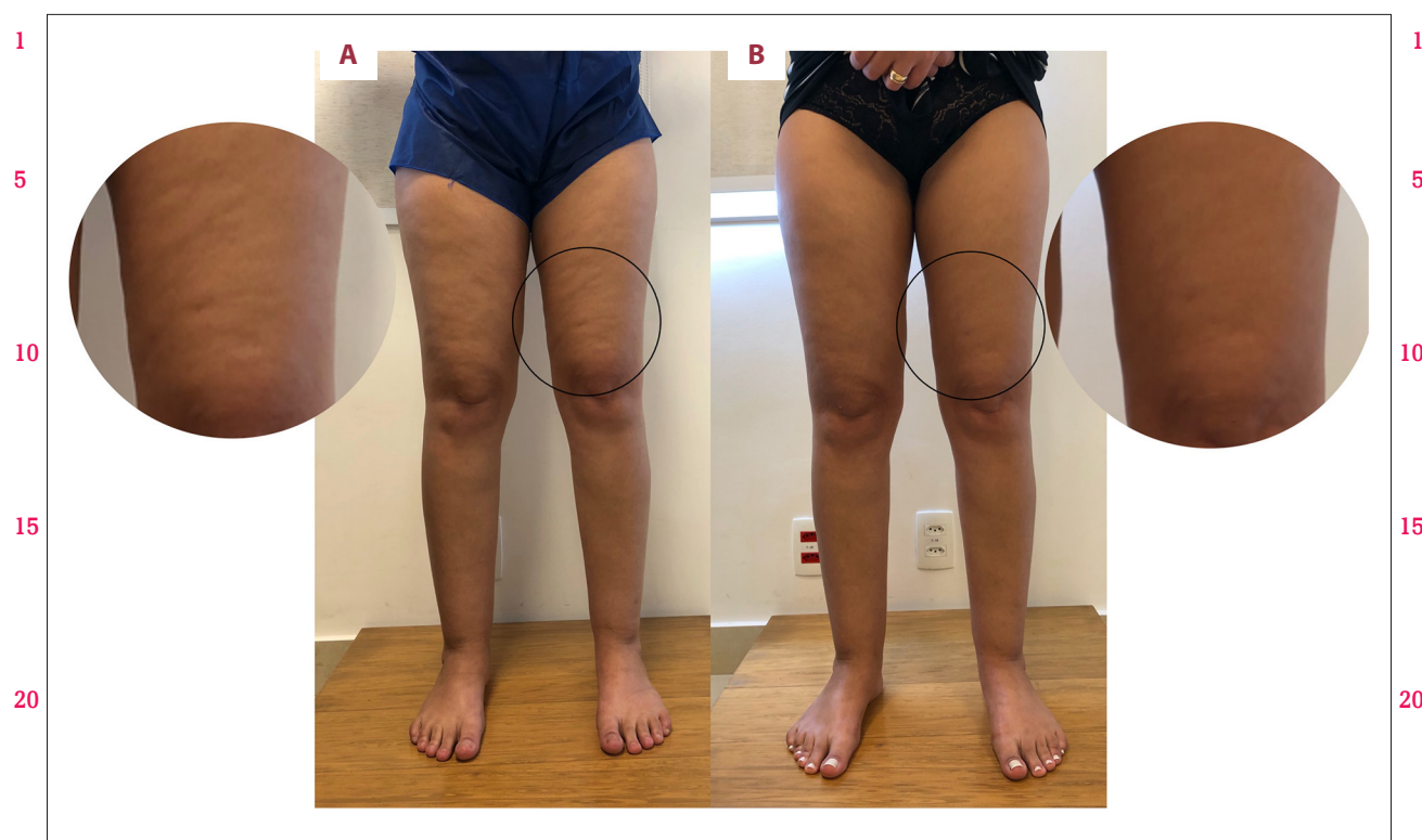
Figure 2. Patient with stage 1 lipedema before (A) and after (B) treatment, showing significant aesthetic improvement of gynecoid lipodystrophy (cellulitis), although it was not the main objective of the treatment.