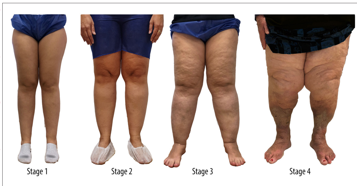
Figure 1. Classification of lipedema by evolutionary stages [21]. Stage 1: normal skin with an enlarged hypodermis; Stage 2: unevenness of the skin texture with pleats of fat and large piles of tissue growing like unencapsulated masses; Stage 3: hardening and thickening of the subcutaneous with large nodules and protrusion of cushions/accumulations of fat, especially in the thighs and around the knees; Stage 4: lipedema with lymphedema, so-called lipolymphedema.

Stage I lipedema is characterized by normal skin with enlarged hypodermis. Stage II is defined as uneven skin texture with pleats of fat and large piles of tissue growing like unencapsulated masses. Stage III is characterized by hardening and thickening of the subcutaneous tissue with large nodules and protrusion of cushions/accumulations of fat, especially in the thighs and around the knees. Finally, stage IV is associated with lymphedema, and is also called lipolymphedema.