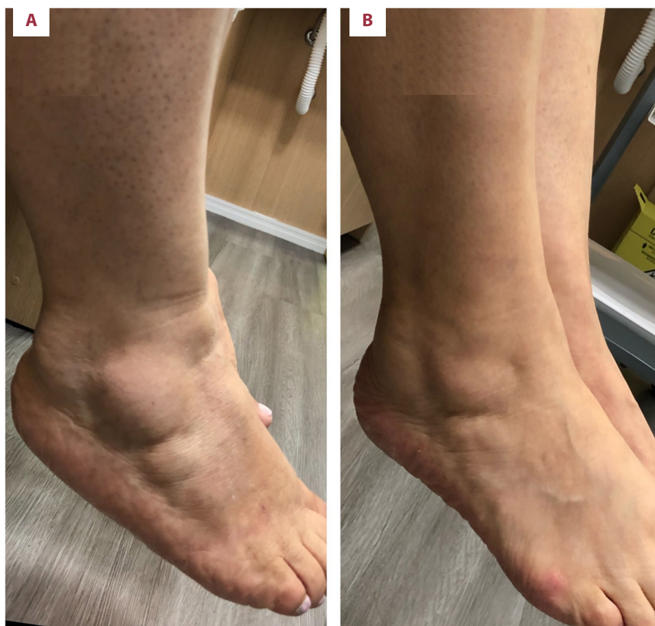
Figure 3. Decrease in painful fat nodules in the lateral malleolus in a patient with stage 1 lipedema. (A) Before. (B) After.